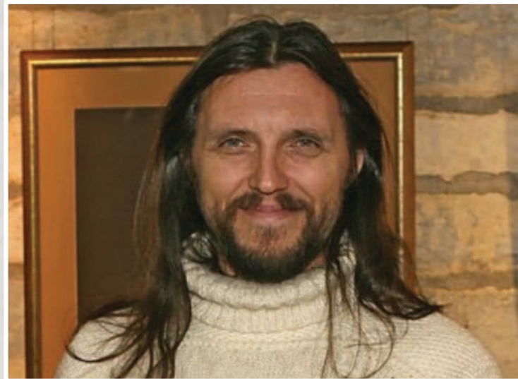
Sergey Torop (Russia)