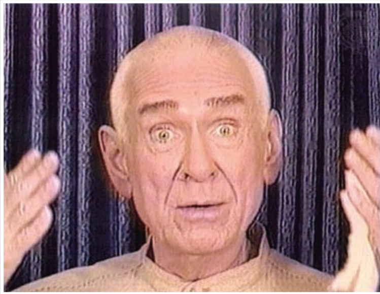
Marshall Applewhite (California)