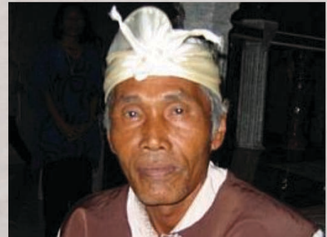
Ayah Pin (Thailand)