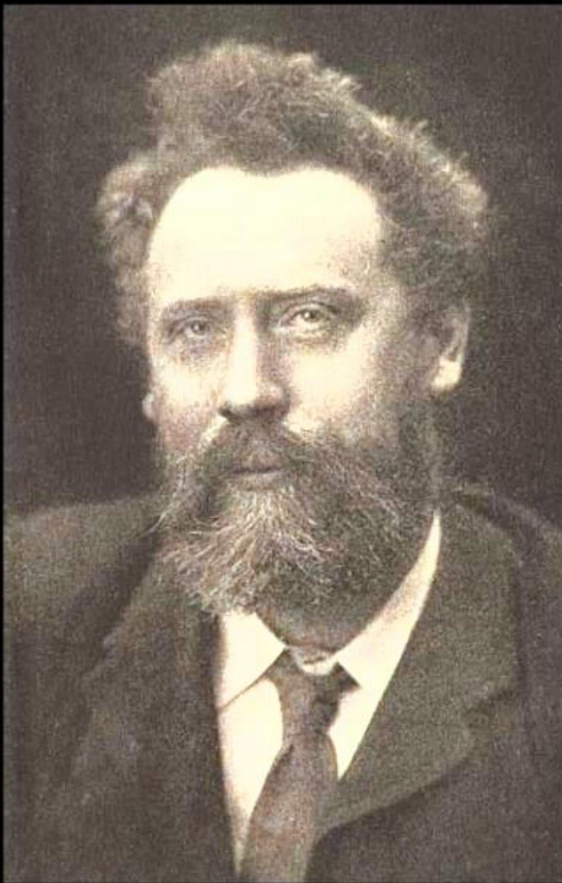
William Ernest Henley 1849 to 1903

It matters not how straight the gate; How charged with the punishments the scroll, I am the master of my fate; I am the captain of my soul.