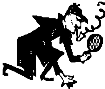
Me as a Christian