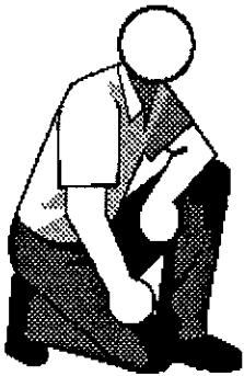
Me as a Non- Christian